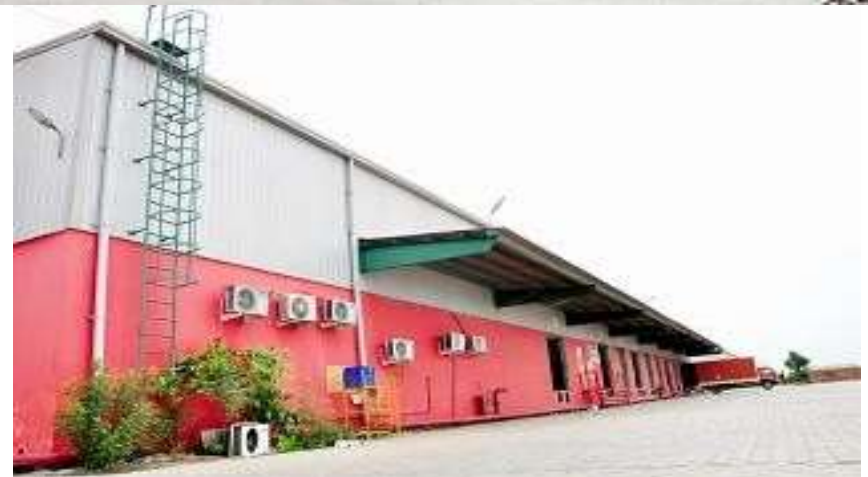
Warehouse Vertical Infra , Kulana Jhajjar