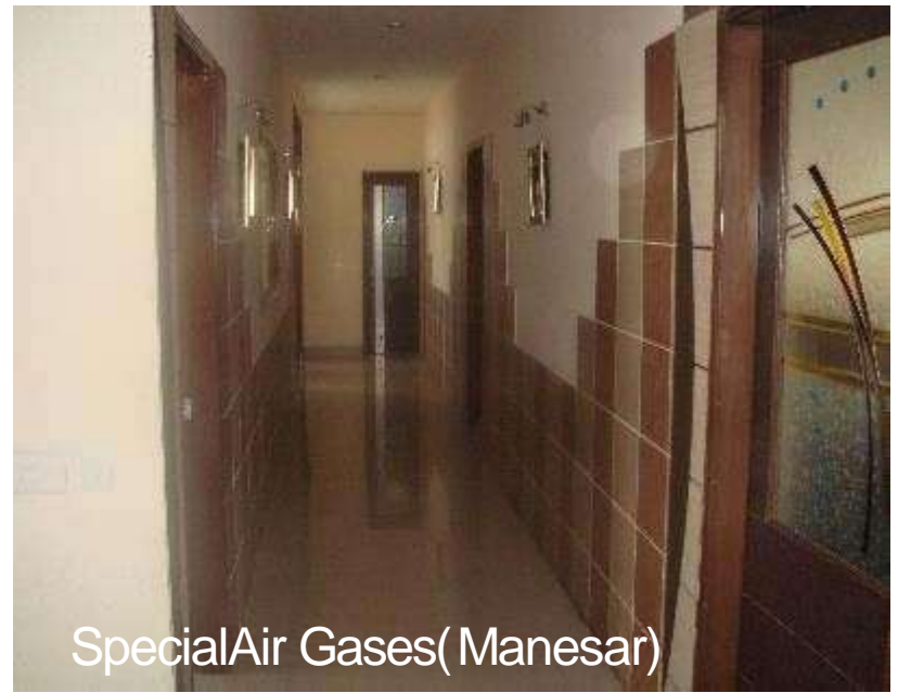
SpecialAir Gases( Manesar)