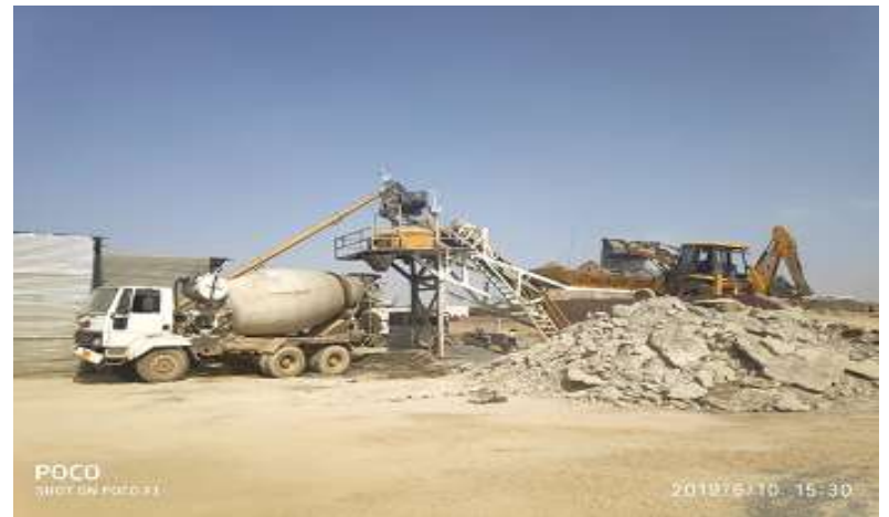
Warehouse, R J Logistics Park, Kulana, Jhajjar, Haryana