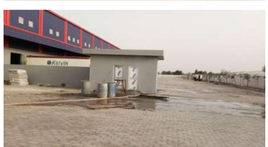
Ware house, Vertical Infra , Kulana , Jhajjar