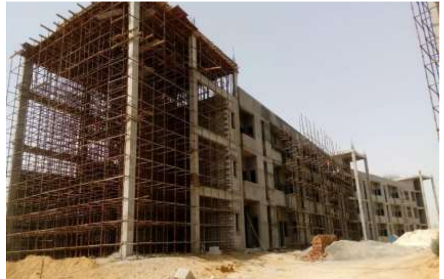
Xavier Labour Relation Institute (MDP)