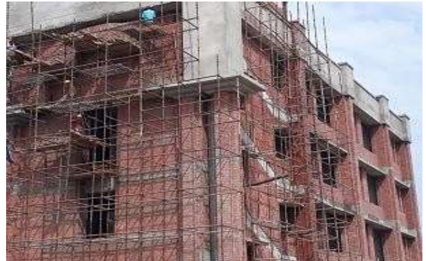
Rosary Public School