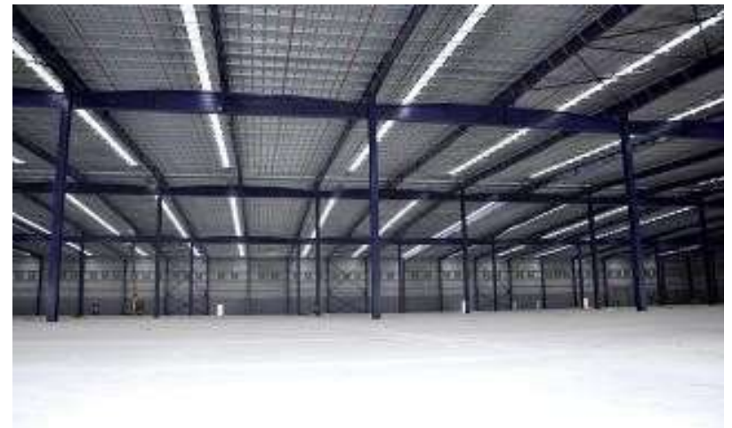
Warehouse , Vertical Infra, Kulana, Jhajar