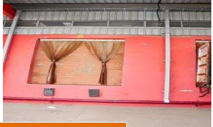
Warehouse , Vertical Infra, Kulana , Jhajjar