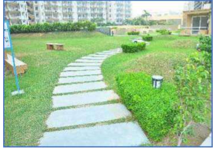
Landscape Tulip Infra