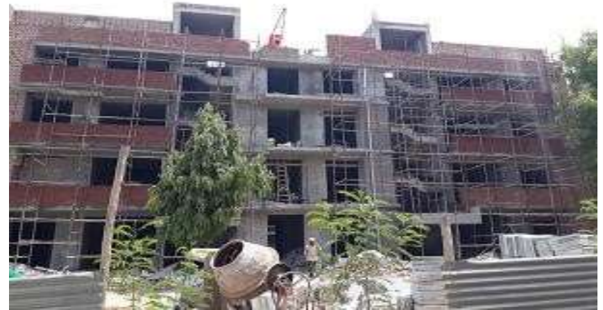
Mirada House Delhi University