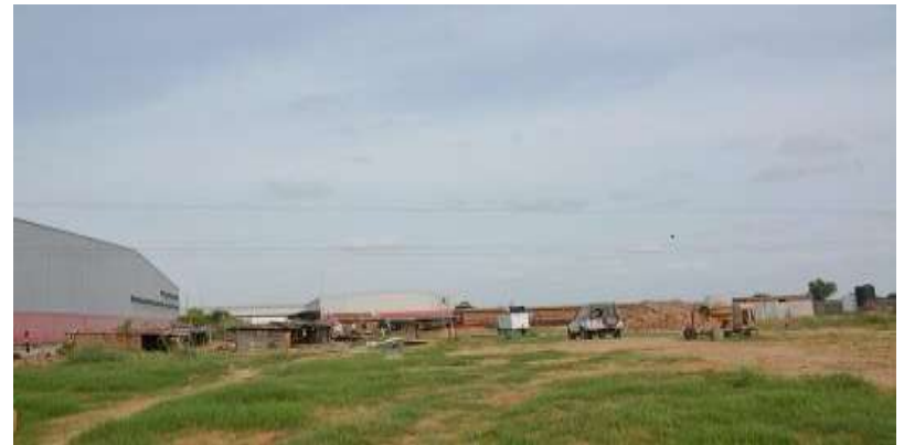
Warehouse , ECOM Express Bilaspur