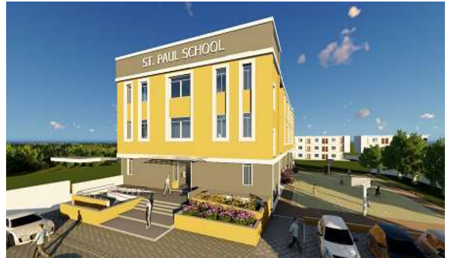
St. Paul's School Aya Nagar New Delhi