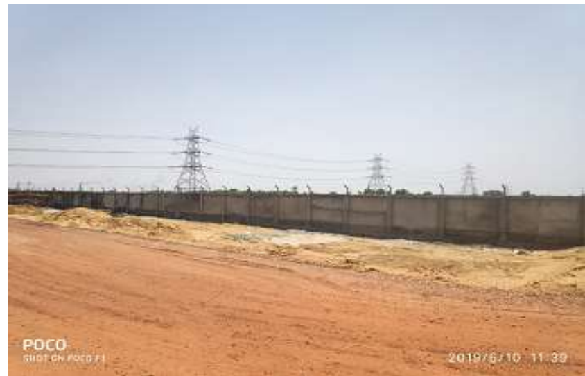
Warehouse , R J Logistics Park, Kulana , Jhajjar, Haryana