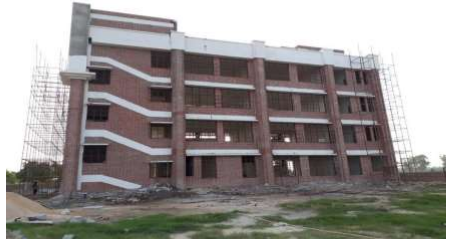
Rosary Public School