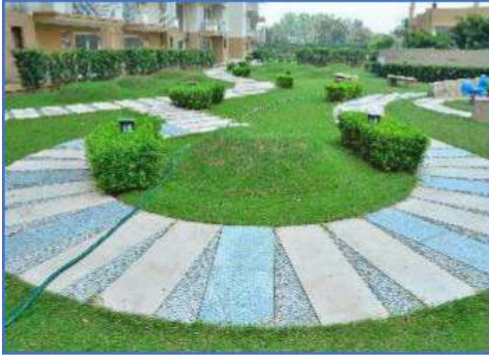
Landscape Tulip Infra