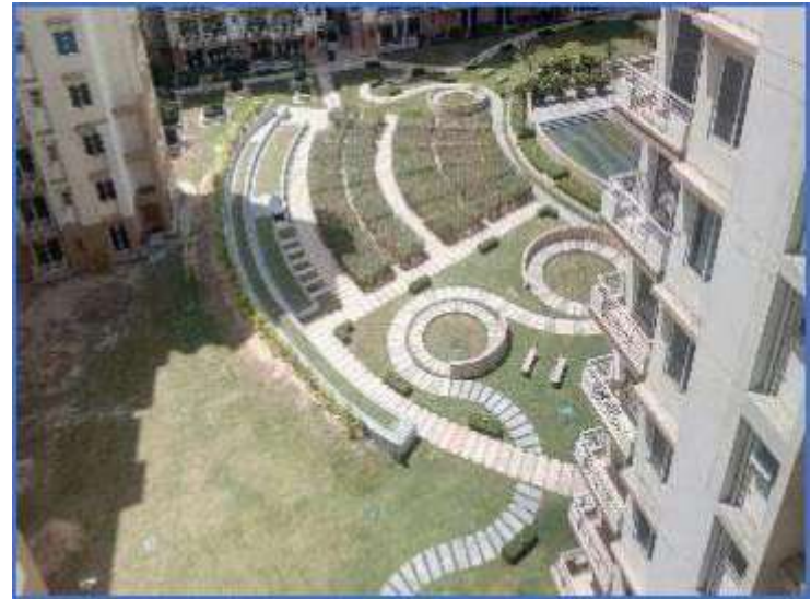
Landscape Tulip Infra