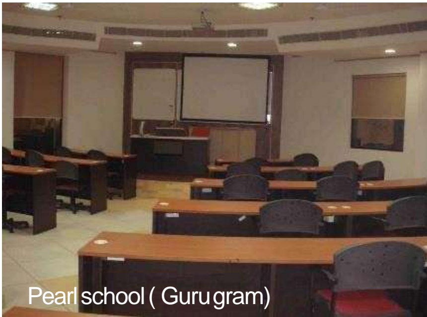
Pearl school ( Guru gram)