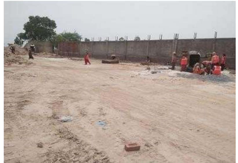
Warehouse , Koka , Jhajjar