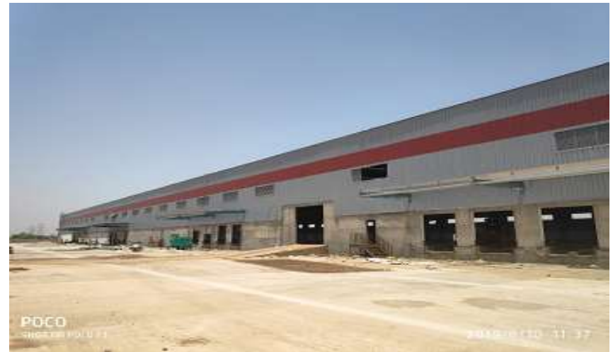
Warehouse , R J Logistics Park, Kulana , Jhajjar, Haryana