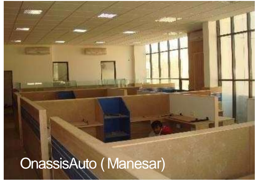
OnassisAuto ( Manesar)