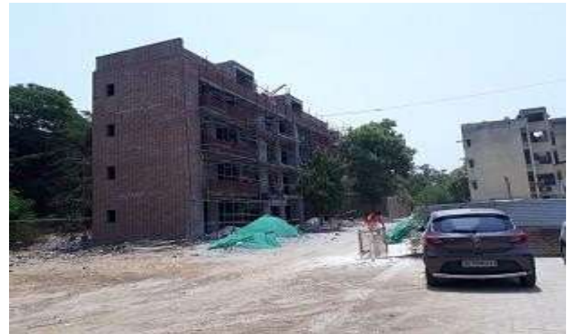
Miranda House Delhi University