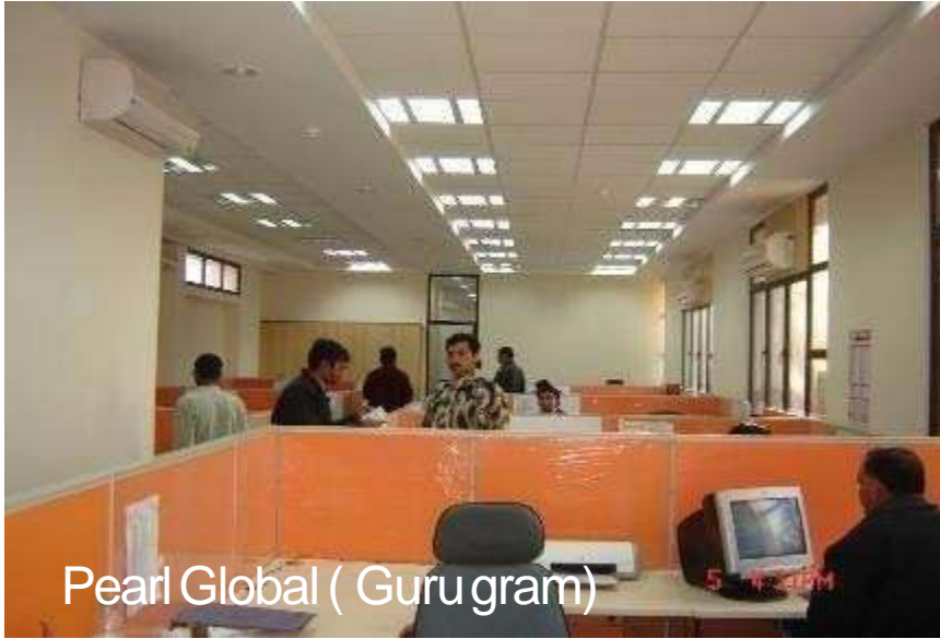
Pearl Global ( Guru gram)