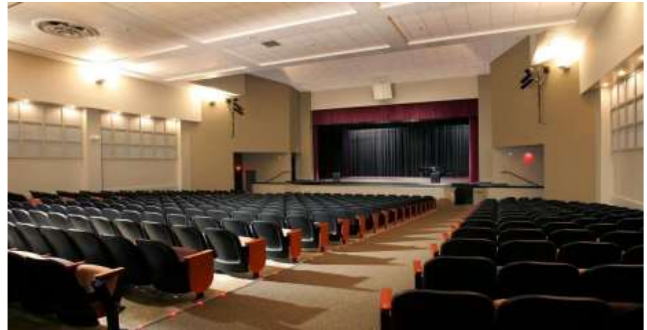
Miranda House Delhi University Auditorium