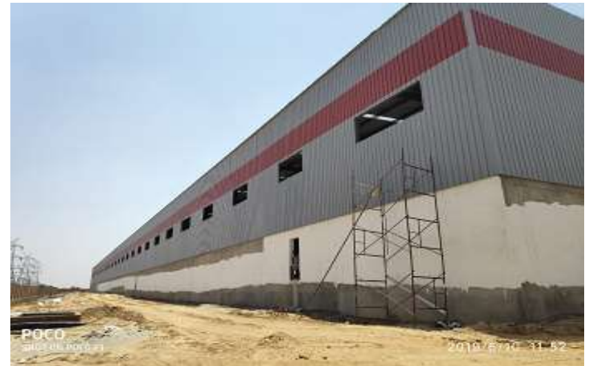
Warehouse , R J Logistics, Kulana, Jhajjar, Haryana